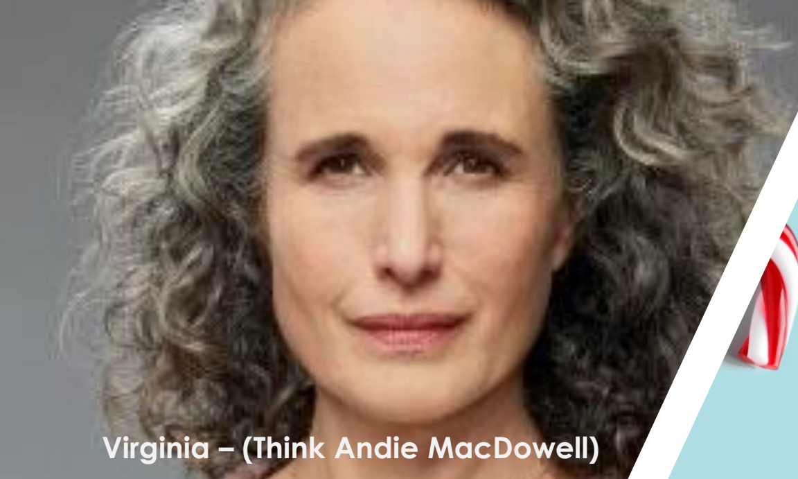
Virginia – (Think Andie MacDowell)