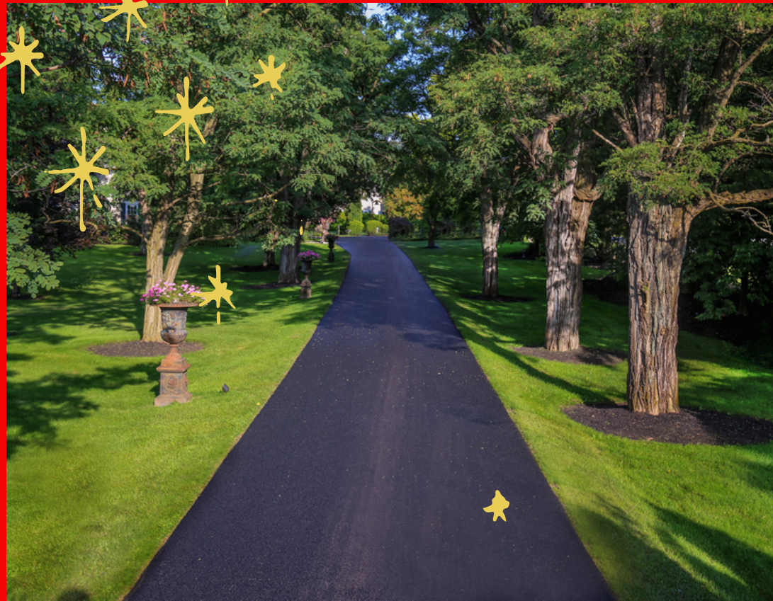
The Driveway/Entrance/Front of the location